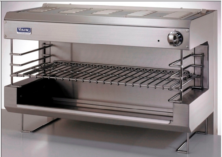
V36CMW [Shown with optional hanging rack supports]